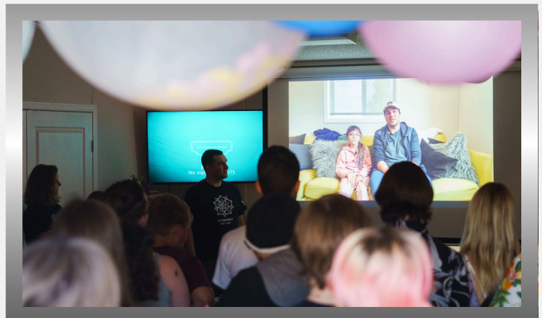
2023 10th Anniversary Celebration