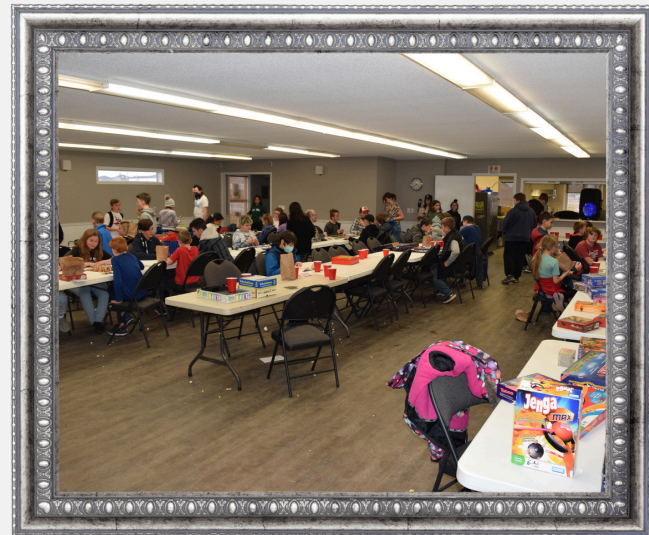
Game Night in Langdon

"Synergy has helped me be more open about my personality through an open and inclusive environment."