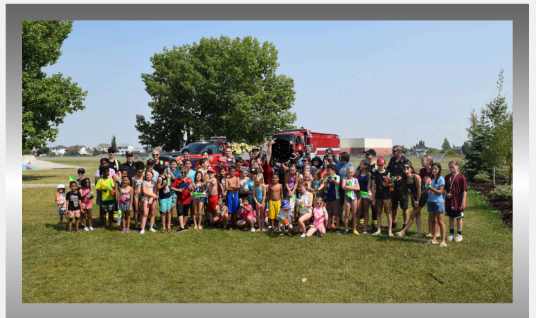
Langdon Pancakes in the Park