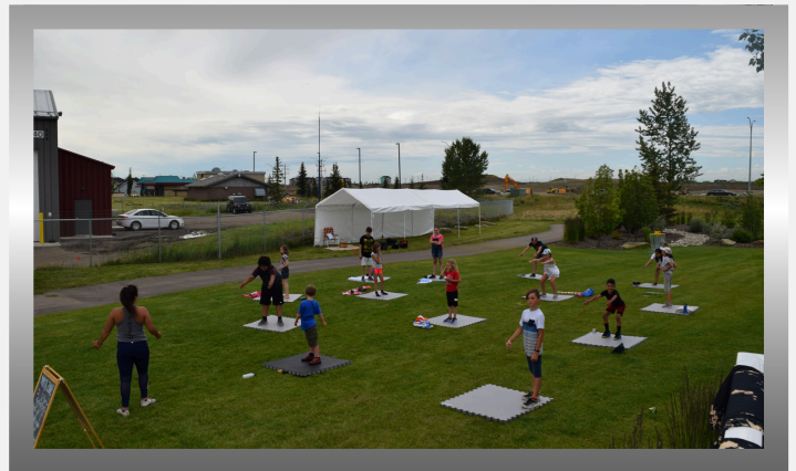
2020 Dabble During COVID