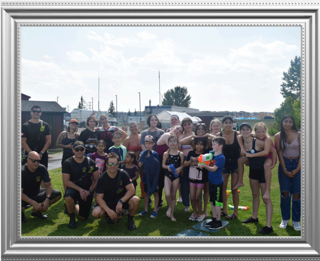
Chestermere Pancakes in the Park

Over 350 Synergy families, participants, community members, and neighboring daycare kids joined us for a fun-filled day.