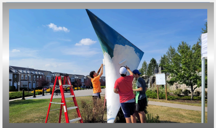
2022 Community Art Refurbishment