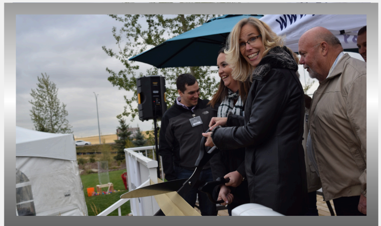
2017 Community Centre Grand Opening