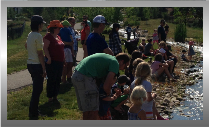
2014 Duck Race