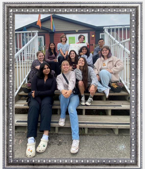
2023 Youth Interns