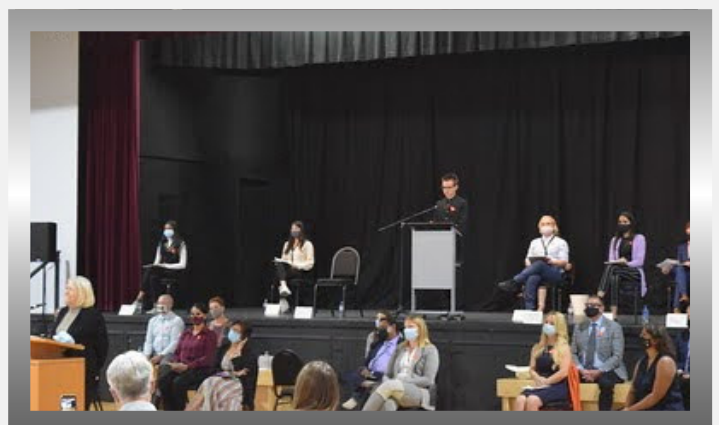
2021 Federal and Municipal All Candidates Forum