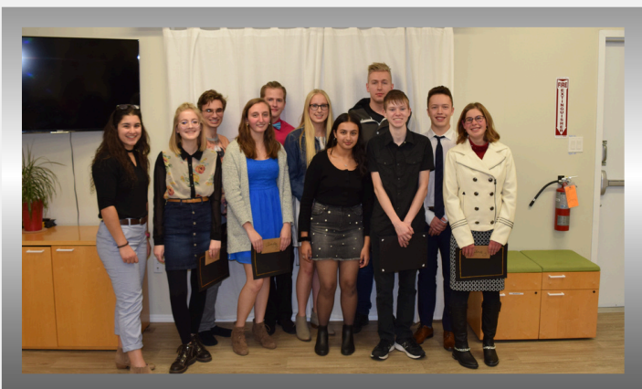
2018 Volunteer Appreciation Night