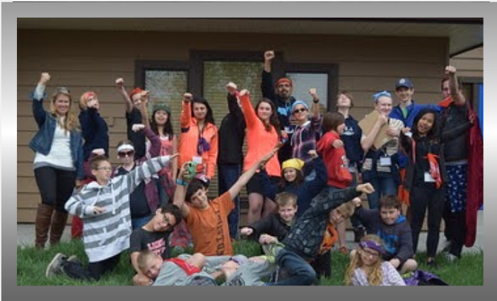
2015 Superhero Retreat