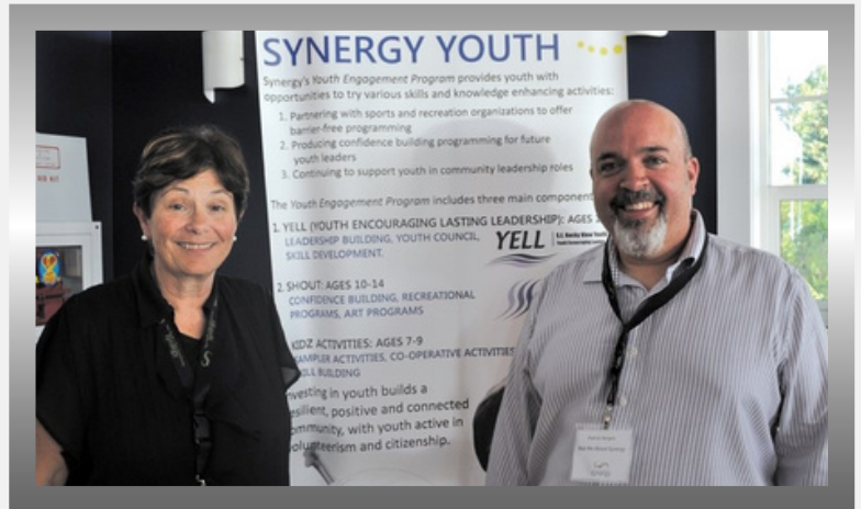
2013 Synergy Launch

Synergy's first programs were Super Sampler and Super Hero Camp offered to youth 10-12 yrs. The underlying theme of both programs was finding passions, giving youth the opportunity to step out of their comfort zone, try new things, and pursue what they were most passionate about. This theme rang true throughout the Chestermere Gives Back Campaign, our first large-scale community initiative highlighting volunteerism in our community. Over the years, our programs, services, and events have grown as Synergy has taken a holistic approach to supporting the leadership and wellness of individuals in Chestermere, Langdon, and South East Rocky View. The Synergy Board and Staff have always been looking ahead to see how they can best support the community as needs and issues change. This has led to involvement in multiple coalitions, community surveys, and research projects. As an agency, Synergy has never shied away from making changes, taking risks, or standing up for our community. We will continue to follow this approach as we head into the future, and strive to reach our vision of connected, engaged, healthy communities.