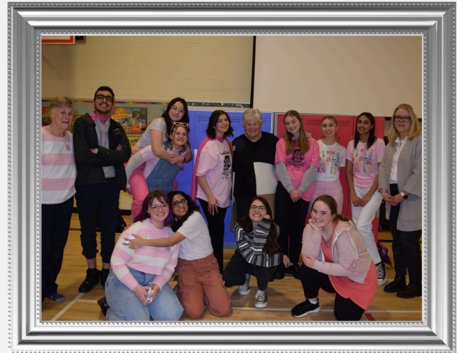
Pretty in Pink

Synergy has a variety of volunteer roles for community members of all ages. We work with our volunteers to determine their passion and assign volunteer roles that are of interest to them and they would benefit from. Synergy helps support local not-for-profits by connecting them with volunteers to help with their events and initiatives.