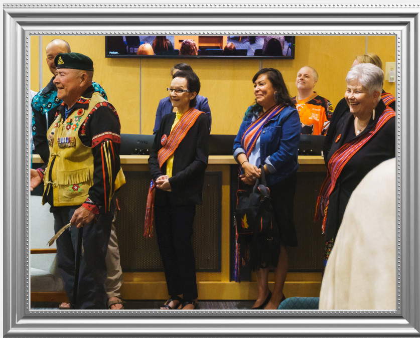
Chestermere Metis Flag Ceremony

"Synergy means more to the community than I think people realize. You can come from any walk of life and be welcomed with open arms. Synergy thrives on the diverse community it resides in, it is a place where support, compassion, kindness, and care are always available. My time spent mentoring there was nothing short of incredible."