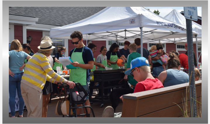
2019 Langdon Pancakes in the Park